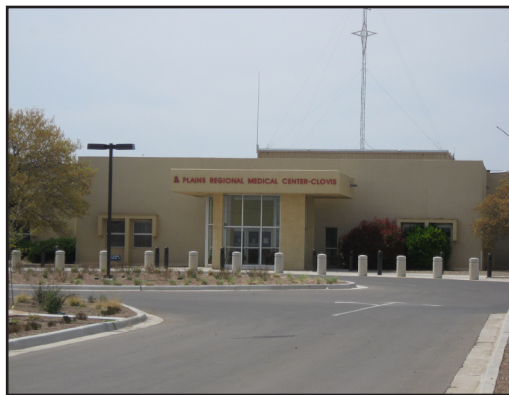
Plains Regional Medical Center