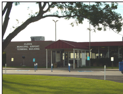
Clovis Municipal Airport Terminal