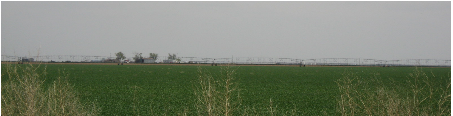
Irrigation system in Curry County

5. Curry County and the City of Clovis should jointly prepare and adopt a wellhead protection program to protect wells from local sources of contamination.