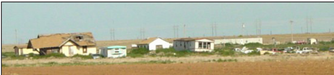
Neglected Property East of Clovis